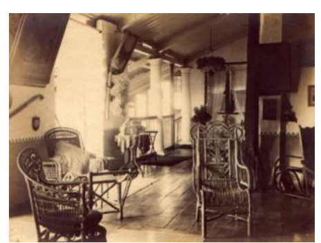
Picture 8. Morning sun on the verandah of the Westerhout home. (circa 1900)