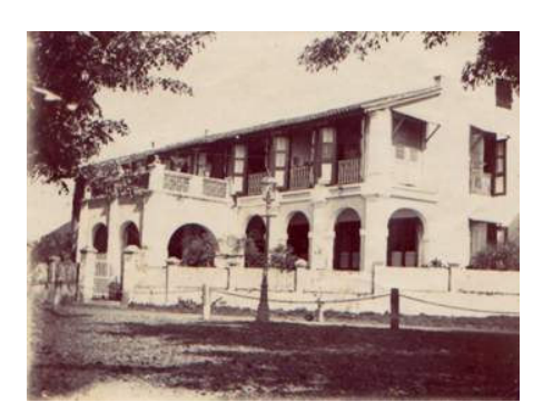
Picture 7 The Westerhout ancestral home. At least 3 generations of the family lived here, in one of the big houses facing the harbour, which were mostly owned by Dutch officials. (circa 1900)